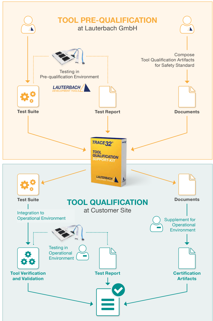
Figure 1: The 2-stage qualification process

The paid test suites Simulator Arm and Simulator TriCore allow the TRACE32